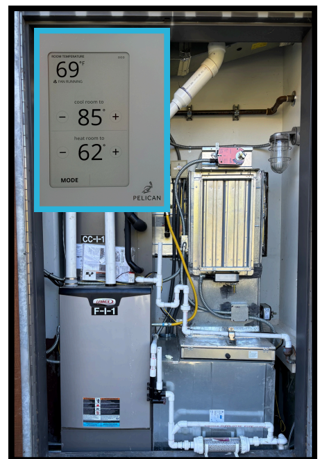
Pictured above are the new HVAC units and furnaces along with the new Pelican thermostats